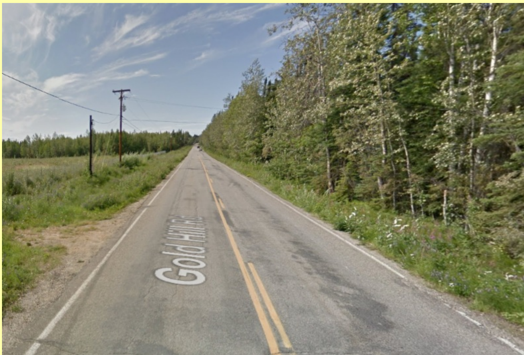
Gold Hill Road